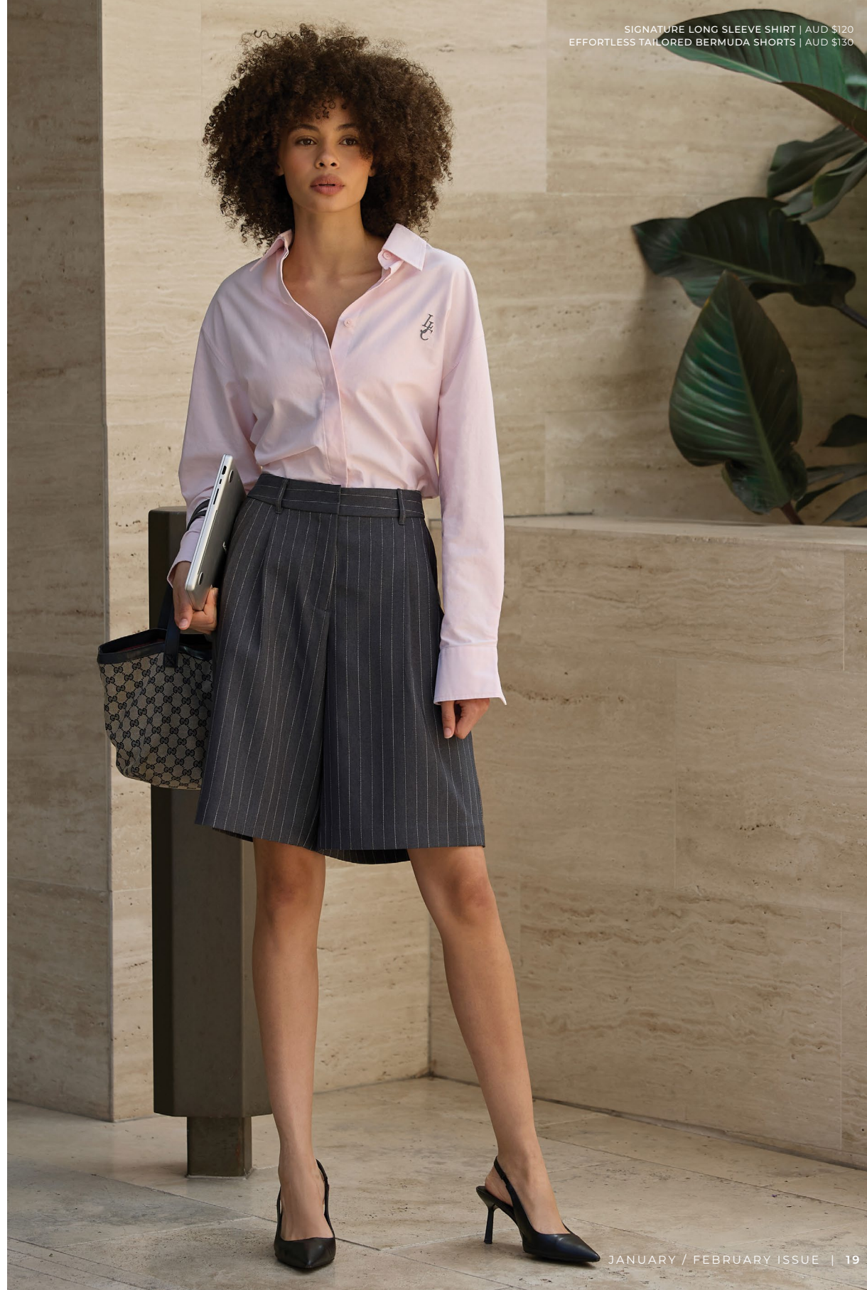
SIGNATURE LONG SLEEVE SHIRT | AUD $120 EFFORTLESS TAILORED BERMUDA SHORTS | AUD $130