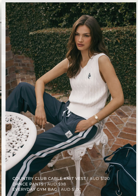
COUNTRY CLUB CABLE KNIT VEST | AUD $120 DANCE PANTS | AUD $98 EVERYDAY GYM BAG | AUD $100