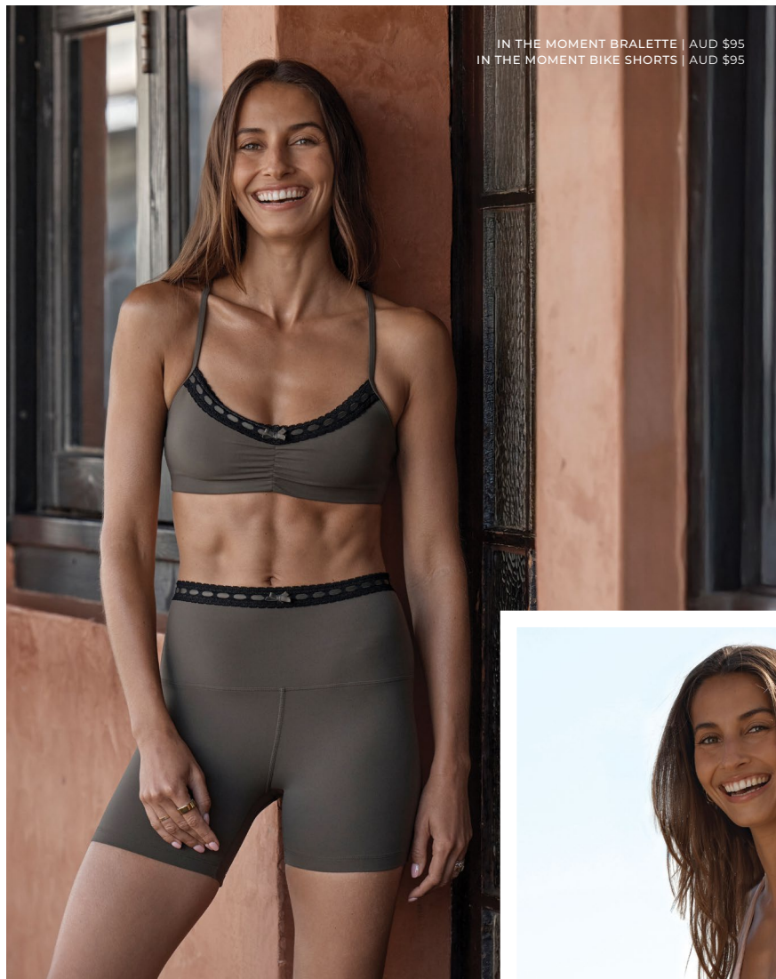
IN THE MOMENT BRALETTE | AUD $95 IN THE MOMENT BIKE SHORTS | AUD $95