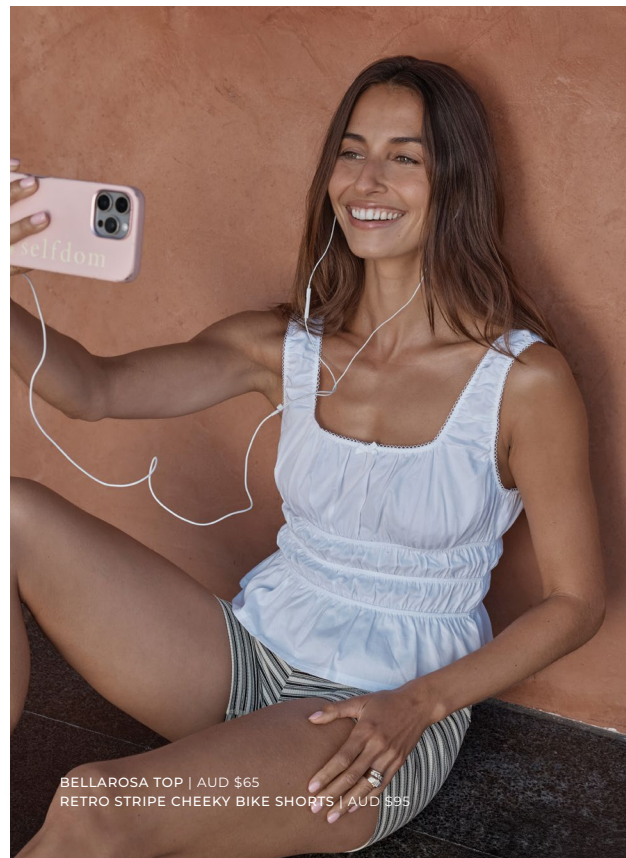
BELLAROSA TOP | AUD $65 RETRO STRIPE CHEEKY BIKE SHORTS | AUD $95