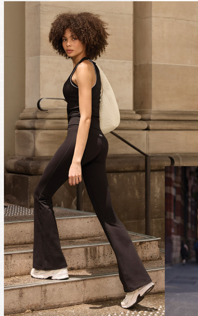
PRETTY SWEET RIB TANK | AUD $60 LOTUS FLARED LEGGINGS | AUD $130