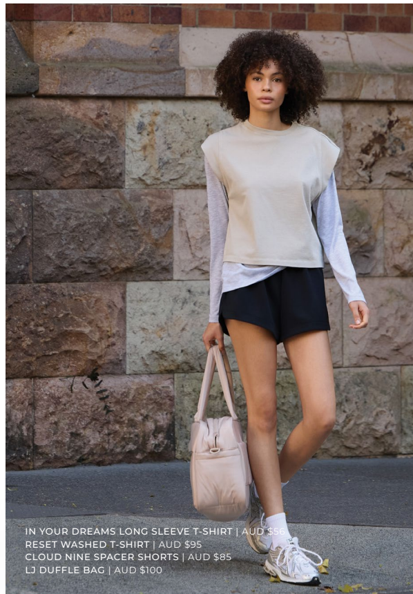
IN YOUR DREAMS LONG SLEEVE T-SHIRT | AUD $55 RESET WASHED T-SHIRT | AUD $95 CLOUD NINE SPACER SHORTS | AUD $85 L3 DUFFLE BAG | AUD $100

This collection will take you between early morning meetings, long lunches and late afternoons. Dress in your best with Lorna Jane, whatever the occasion.