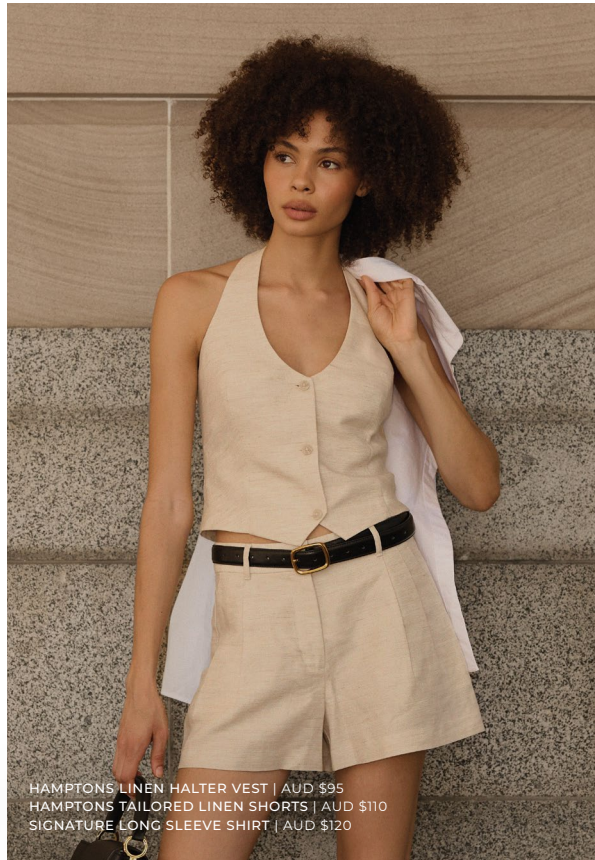
HAMPTONS LINEN HALTER VEST | AUD $95 HAMPTONS TAILORED LINEN SHORTS | AUD $110 SIGNATURE LONG SLEEVE SHIRT | AUD $120