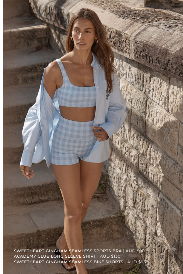
SWEETHEART GINGHAM SEAMLESS SPORTS BRA | AUD $90 ACADEMY CLUB LONG SLEEVE SHIRT | AUD $130 SWEETHEART GINGHAM SEAMLESS BIKE SHORTS | AUD $95