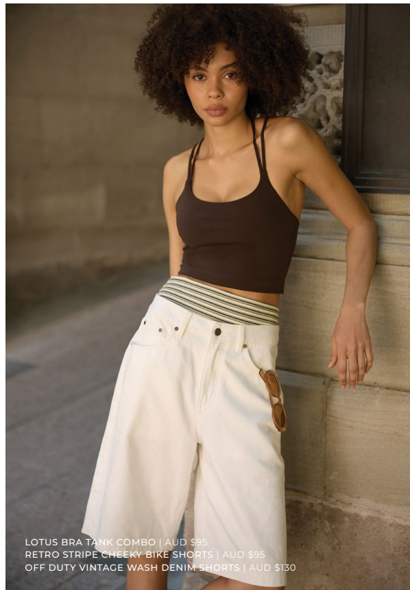
LOTUS BRA TANK COMBO | AUD $95 RETRO STRIPE CHEEKY BIKE SHORTS | AUD $95 OFF DUTY VINTAGE WASH DENIM SHORTS | AUD $130