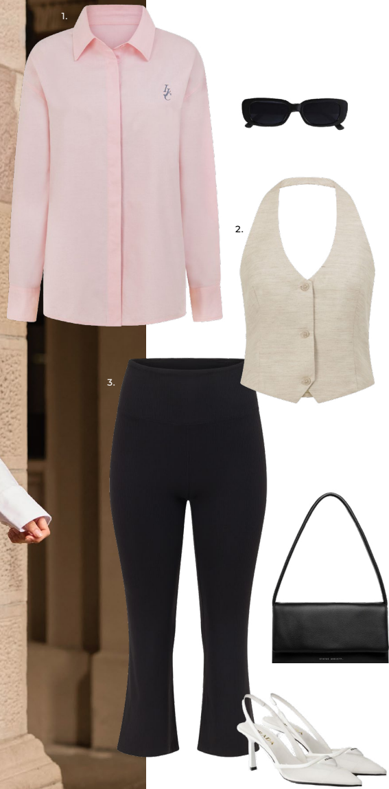
1. SIGNATURE LONG SLEEVE SHIRT | AUD $120 2. HAMPTONS LINEN HALTER VEST | AUD $95 3. IRRESISTIBLE LUXE ACTIVE RIB CROPPED YOGA PANTS | AUD $135