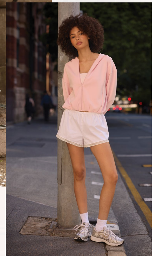
ICON BOOBTUBE | AUD $60 CLOUD NINE SPACER ZIP THROUGH HOODIE | AUD $189 BELLAROSA SHORTS | AUD $60