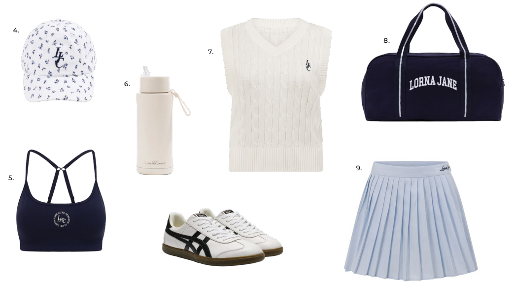
1. ACADEMY CLUB LONG SLEEVE SHIRT | AUD $130 2. ORIGINAL SPORT RIB TANK | AUD $55 3. DANCE PANTS | AUD $98 4. PROVINCIAL FLORAL CAP | AUD $45 5. SAMMY LIMITED EDITION SPORTS BRA | AUD $85 6. ESSENTIAL 1L INSULATED WATER BOTTLE | AUD $60 7. COUNTRY CLUB CABLE KNIT VEST | AUD $120 8. EVERYDAY GYM BAG | AUD $100 9. ACADEMY CLUB SKIRT | AUD $110

Back to a busier life? Consider your wardrobe handled. Dress how you want to live this year in pieces designed with intention - made to layer cleanly, coordinate seamlessly and deliver confidence.