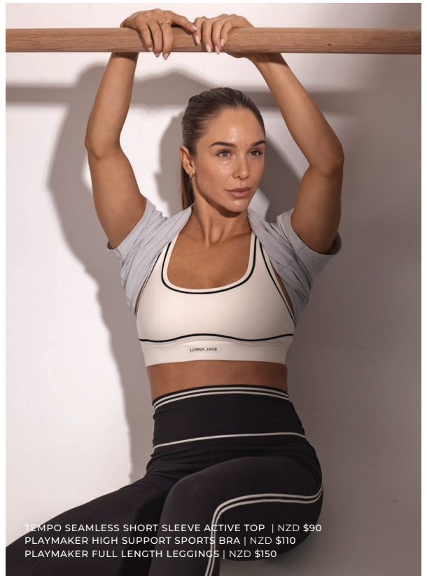
TEMPO SEAMLESS SHORT SLEEVE ACTIVE TOP | NZD $90 PLAYMAKER HIGH SUPPORT SPORTS BRA | NZD $110 PLAYMAKER FULL LENGTH LEGGINGS | NZD $150