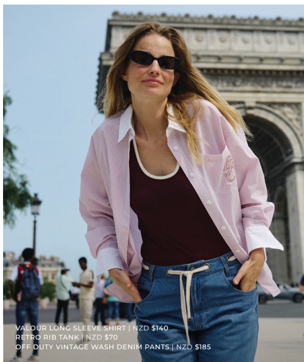
VALOUR LONG SLEEVE SHIRT | NZD $140 RETRO RIB TANK | NZD $70 OFF DUTY VINTAGE WASH DENIM PANTS | NZD $185