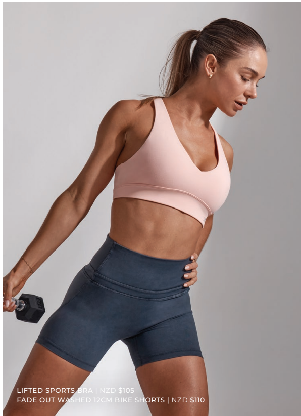
LIFTED SPORTS BRA | NZD $105 FADE OUT WASHED 12CM BIKE SHORTS | NZD $110