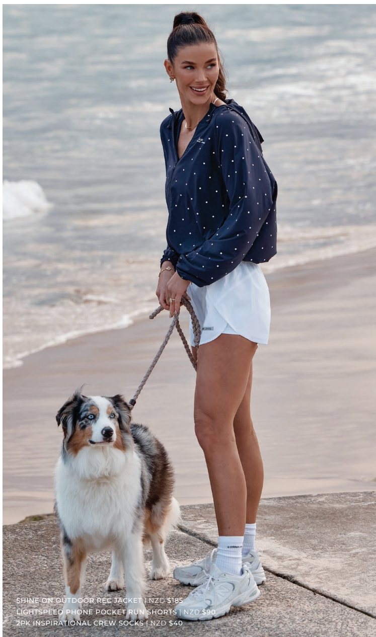
SHINE ON OUTDOOR REC JACKET | NZD $185 LIGHTSPEED PHONE POCKET RUN SHORTS | NZD $90 2PK INSPIRATIONAL CREW SOCKS | NZD $40