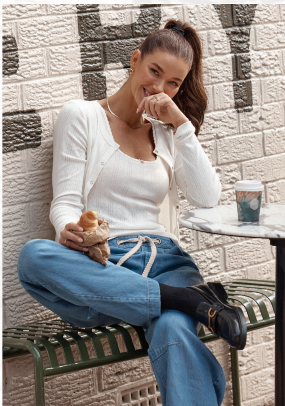
LOVE STORY CARDIGAN | NZD $110 LOVE STORY TANK | NZD $70 OFF DUTY VINTAGE WASH DENIM PANTS | NZD $185

Activewear was just the beginning. We've taken everything you love about Lorna Jane - fit, function, style - and stitched it into relaxed denim pieces designed for your every day.