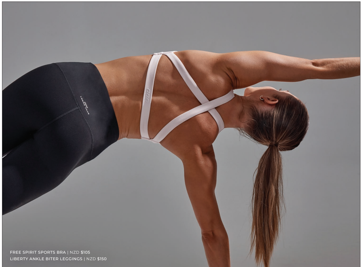
FREE SPIRIT SPORTS BRA | NZD $105 LIBERTY ANKLE BITER LEGGINGS | NZD $150