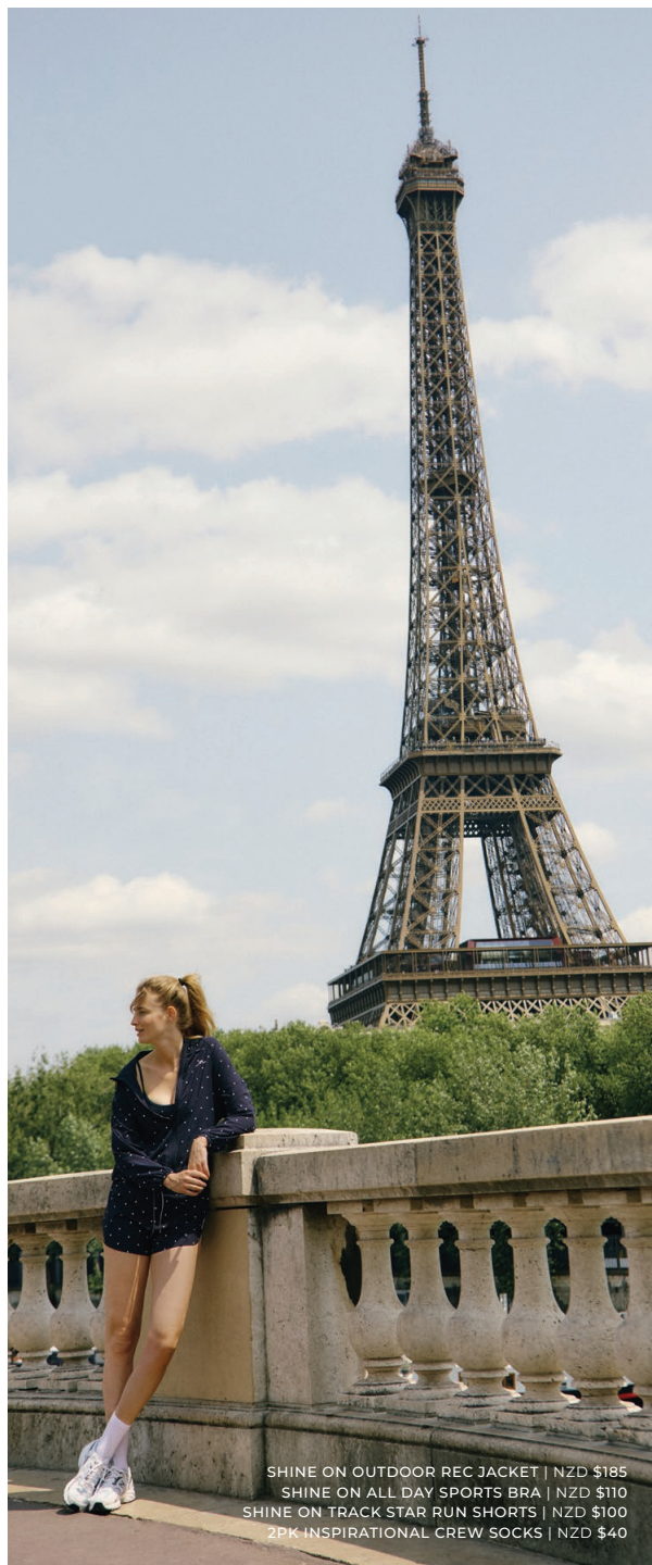
SHINE ON OUTDOOR REC JACKET | NZD $185 SHINE ON ALL DAY SPORTS BRA | NZD $110 SHINE ON TRACK STAR RUN SHORTS | NZD $100 2PK INSPIRATIONAL CREW SOCKS | NZD $40