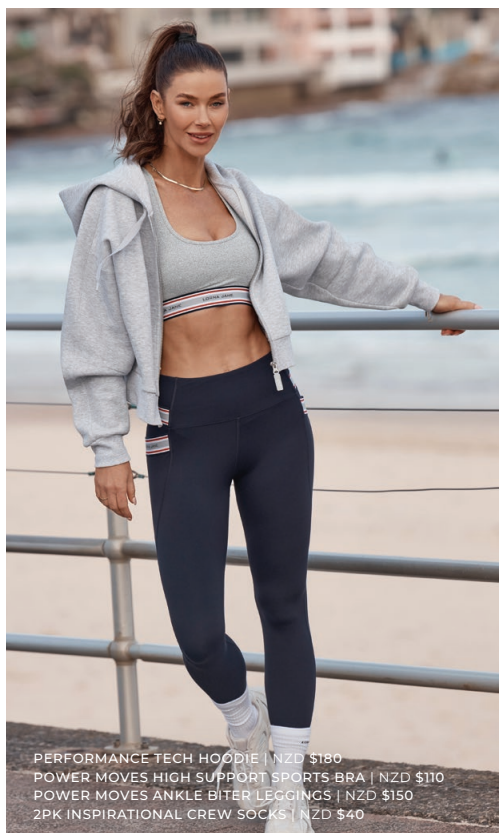
PERFORMANCE TECH HOODIE | NZD $180 POWER MOVES HIGH SUPPORT SPORTS BRA | NZD $110 POWER MOVES ANKLE BITER LEGGINGS | NZD $150 2PK INSPIRATIONAL CREW SOCKS | NZD $40